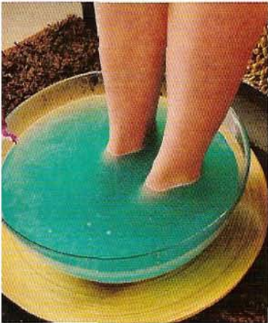
The sensual Balinese pedicure

There is a hidden oasis in Leucadia; a fairyland of the sensual and sublime. A few steps off Highway 101 and through the back gate bring you into a garden with a koi