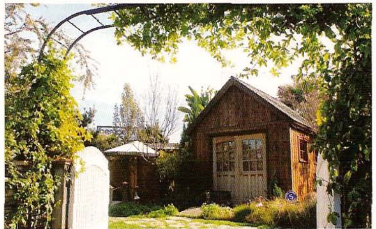
A charming treatment hut which also serves as a private yoga studio.